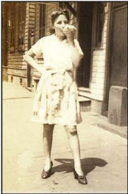
Mom eating a "snowball" Magazine Street, New Orleans ~ 1940