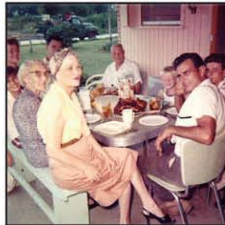
Multiple generations of our family Metairie ~ 1959