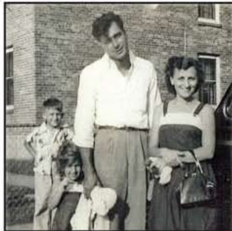
My parents, brother, and I Irish Channel, New Orleans ~ 1951